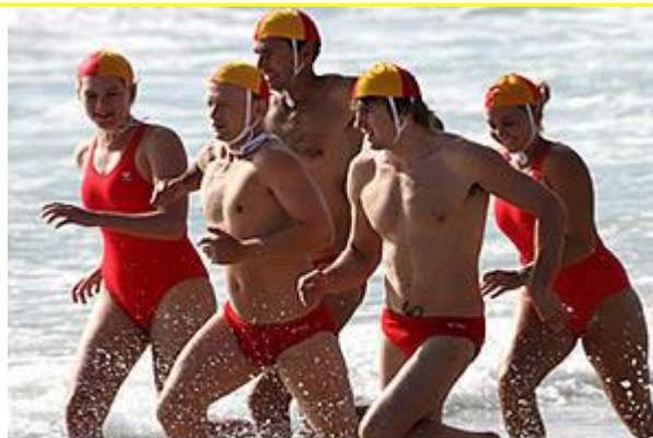
Developing great Australians.

Every patrolling volunteer surf lifesaver must have their Bronze Medallion. This involves over 40 hours of assessment in many areas including CPR, rescue techniques, First Aid and fitness testing and must be updated each year.