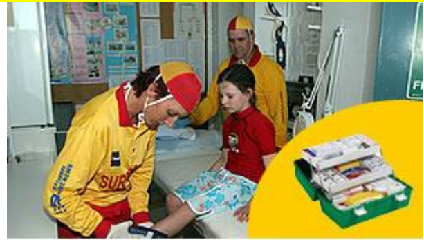
Lifesavers give more than 30,000 First Aid treatments yearly.

In fact on average, each club spends over $2,000 on First Aid supplies each year. Not surprising when you consider that lifesavers perform over 30,000 First Aid treatments each season from marine bite stings and minor cuts to suspected fractures and spinal damage.