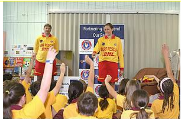
Lifesavers educate thousands of school children each year.

It costs up to $500 to run a basic surf safety demonstration for the community.